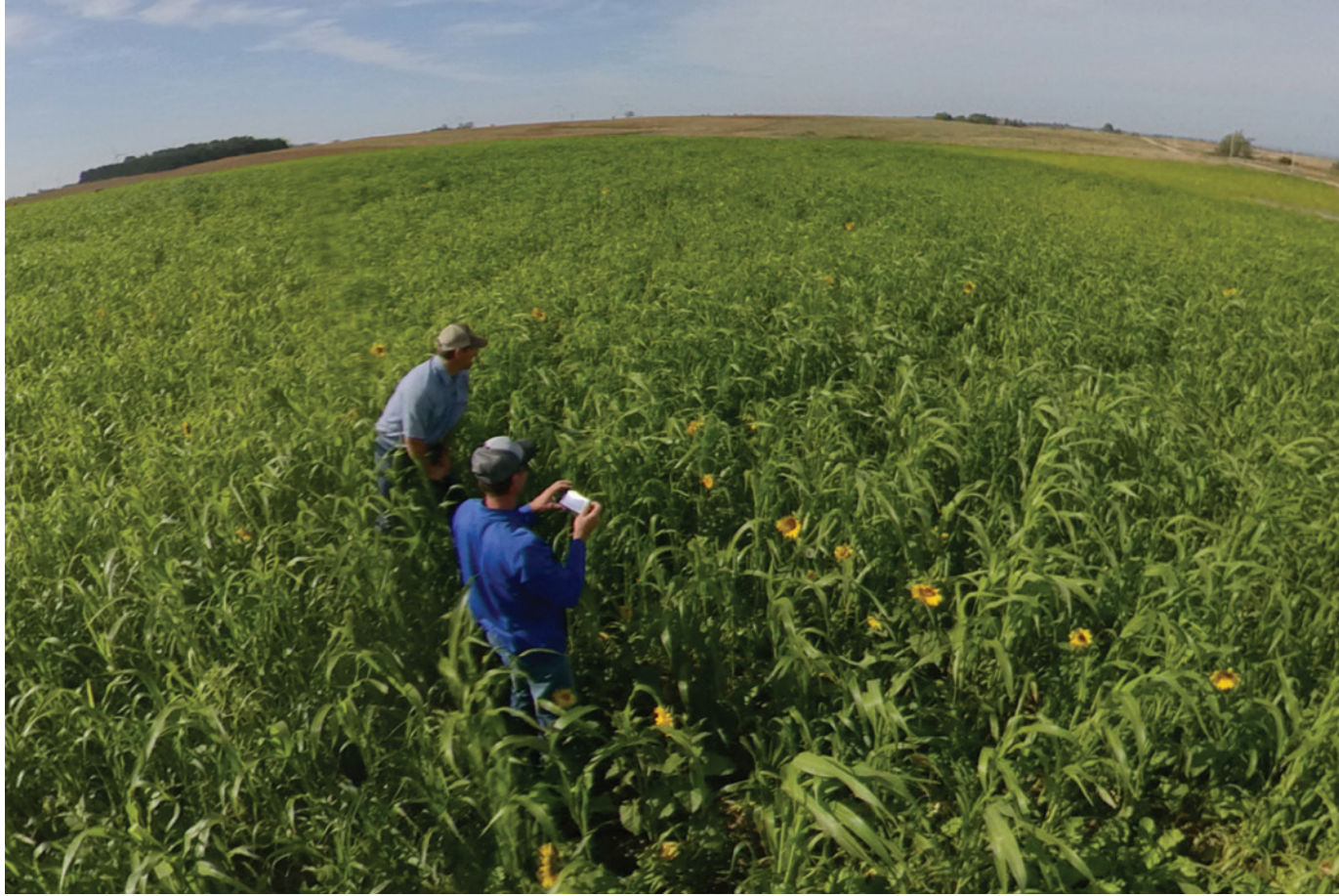
Greater investment is needed in research and technical support for integrated weed management systems.

This report has outlined what little is known of the impacts of dicamba and similar plant growth regulator herbicides to herbaceous and woody plants and the wildlife that depend on them. It also summarizes the many unknown off-target impacts of these herbicides that need to be addressed in future research. While current dicamba injury claims, rulings, and settlements almost exclusively address crop damage, harm to wildlife and habitat