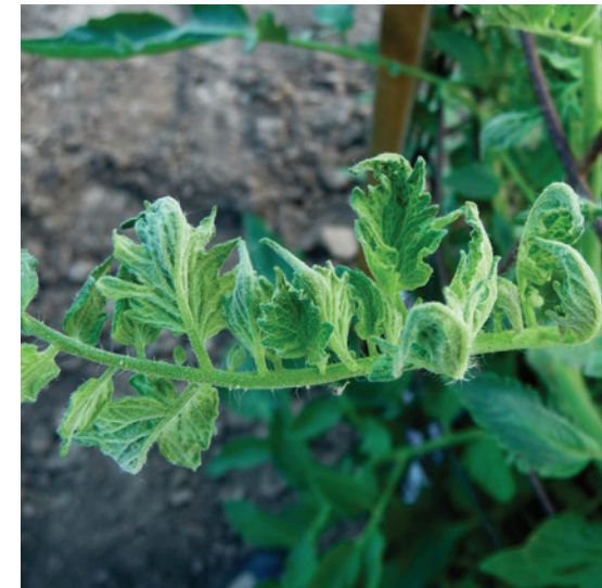
Tomato plant with symptoms of herbicide injury.

While the new over-the-top formulations in soybean and cotton appear to be the main source of dicamba-related pesticide injury reports over the past few years, other dicamba formulations used for post-emergent weed control in corn also pose concerns. According to a survey of Nebraska farmers in 2017, about 30% of dicamba injury observed on non-dicamba resistant soybean may have been attributable to use in corn. 20 Mid-season applications of dicamba products in corn have increased in recent years to control glyphosate-resistant weeds. 26 Weed scientists from Iowa State University echoed this and reported an increase of dicamba use in corn both in acreage and rate of application. 12 Label guidance and Extension recommendations around the use of these products is highly variable and often does not adequately reflect concerns with drift and volatility.