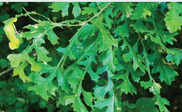
Elongated leaves in Burr oak. Credit: Martin Kemper.

Dicamba damage — recognizing it. If you suspect your trees may have herbicide damage, first become familiar with the most common leaf symptoms: cupping, curling, twisting, elongation, or stunted, smaller leaves. You may also see some branch dieback. There are many places where you can find photographs of trees and plants that have received herbicide damage, such as university extension plant health guides and reputable tree and plant health resources on the internet.