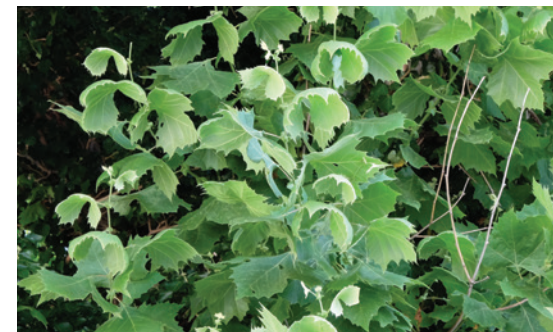
Sycamore curling and cupping.