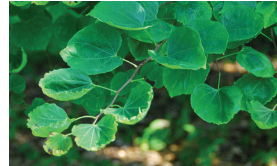
Redbud curling and cupping.

Wild plants are at risk of a range of injuries from particle and vapor drift. Unsightly injuries can occur from very low doses of dicamba and some other herbicides. Drift rates of dicamba and 2,4-D on ornamental plants can reduce flower production, and cause foliage injuries such as leaf twisting, stunting, and curved stems. 34 In pecan trees, dicamba and 2,4-D drift can cause severe injuries including deformed foliage, branch dieback and arrested nut development. 35 Depending on the developmental stage of exposure and growing conditions after exposure, some annual and