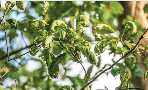
Curling, stunted and deformed leaves.