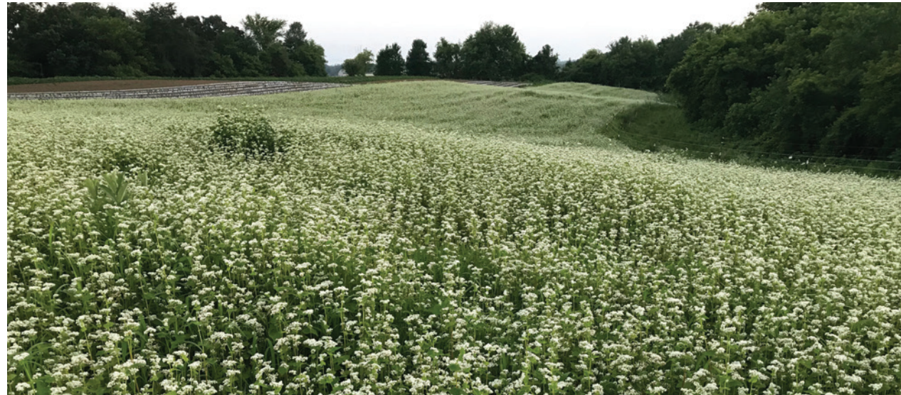
Buckwheat can help improve soil health, suppress weeds, and provide resources for pollinators.

Herbicide-resistant weeds can spread quickly—moving from a single introduction to over 20% of a field area within 2 years—when managed only with the herbicides to which they’ve developed resistance. Palmer amaranth and waterhemp are prolific seed producers and have a zero tolerance threshold, as individual plants can deposit thousands of seeds into the seed bank. 90 Surveys estimates