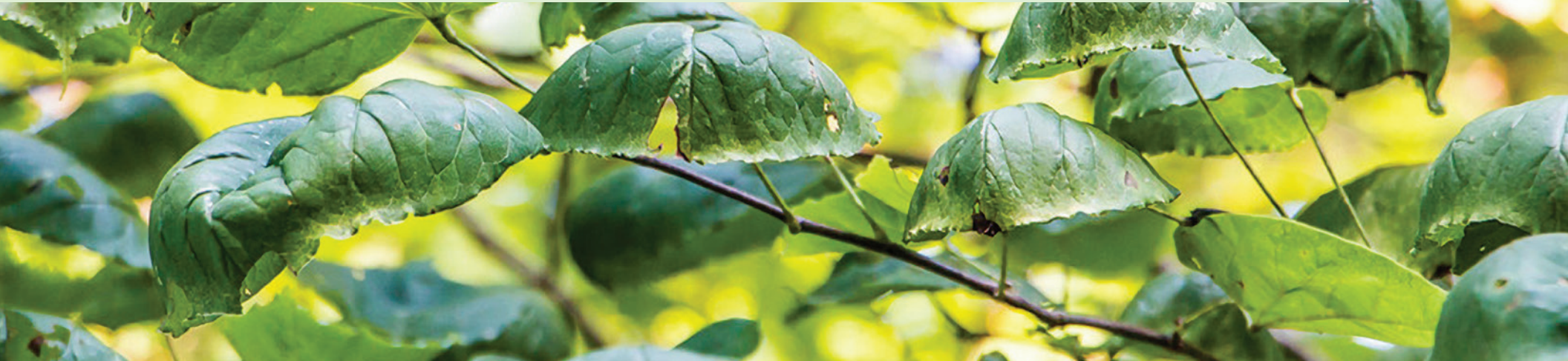
Redbud with irregular margins and cupping.

The impacts of the herbicide dicamba to wild plant communities and wildlife habitat in agricultural landscapes