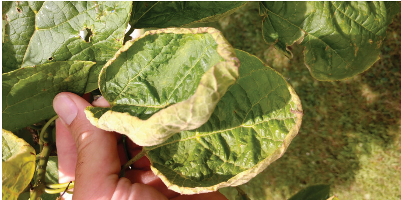
Curled and cupped Northern catalpa leaves.

The EPA's definition of drift excludes volatility or vapor drift because it can occur days after application and cannot be fully controlled by the applicator. As a result, little is being done to protect crops and wild plants from injury due to volatilization.