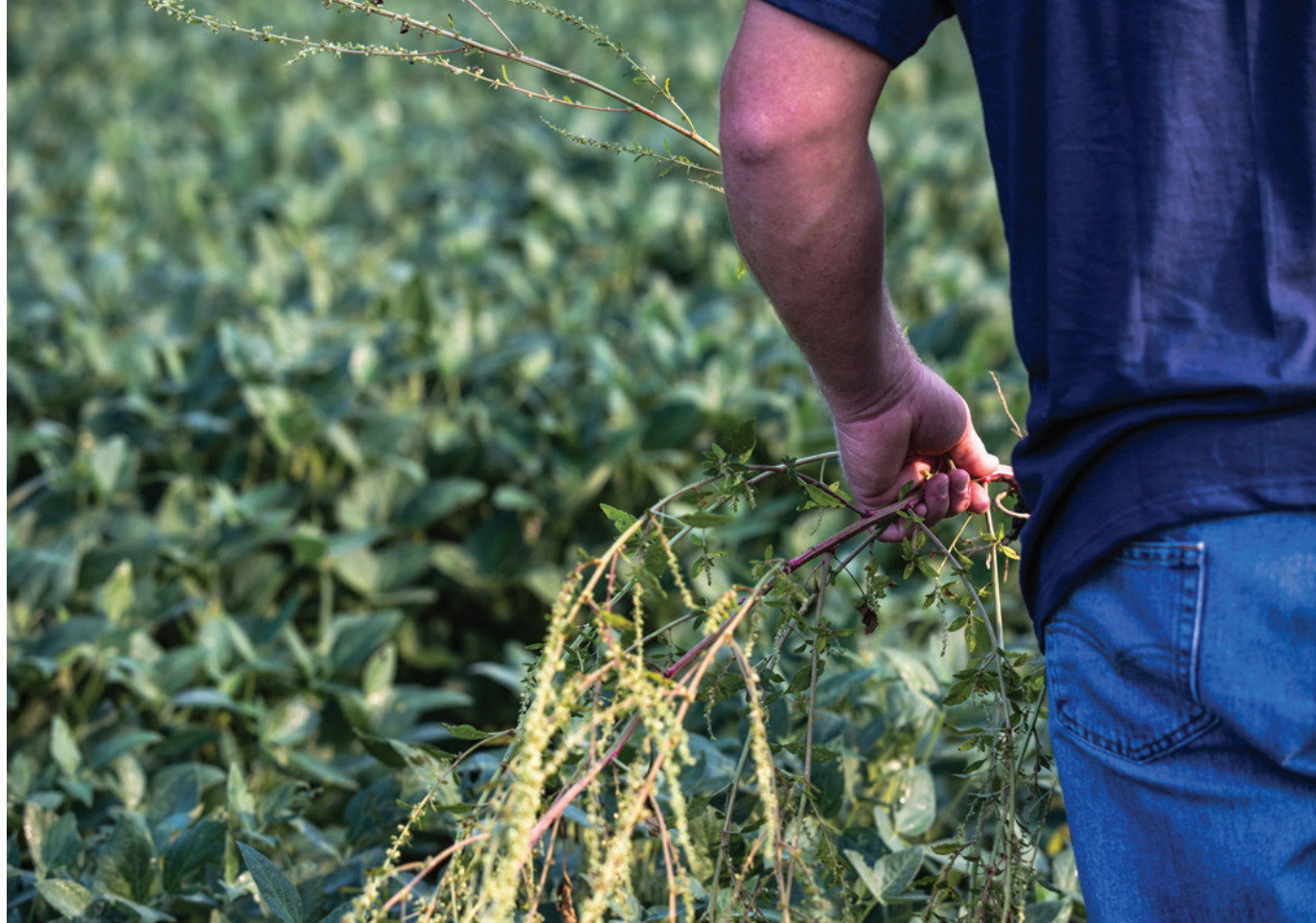
Palmer amaranth, a highly competitive annual weed in row crops like soybean.

Dicamba was first introduced in the 1960s and has been widely used for broadleaf weed control in crops, lawns, and turfgrass. Dicamba and the similar herbicide 2,4-D are synthetic auxins, or growth regulator herbicides that mimic plant hormones and disrupt growth in broadleaf plants, including many weeds. In crops, these pre- and post-emergent herbicides have historically been used at the beginning of the growing season to “burn down” annual broadleaf weeds to prepare crop fields for planting.