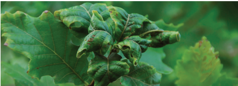
Young white oak tree showing symptoms of potential growth regulator herbicide injury.

News stories about the destruction dicamba has wrought in the last few years have mostly featured farmers suing other farmers or neighbors getting into arguments about damage to their commercial row crops, including non-resistant soybeans. For this report on impacts to other plants and wildlife, we spoke with a few people who are experiencing damage to their property and livelihoods, including their organic farms, forests, and apiaries.