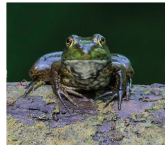
Amphibians can be highly susceptible to environmental contaminants. Credit: Rob Kanter.

Amphibians are of unique interest in regards to environmental pesticide exposures due to their complex lifestyle and metamorphoses. They inhabit the water and land, and undergo dramatic physiological changes throughout their lifecycle. They also have permeable skin, which can allow for rapid exposure and uptake of environmental contaminants. 78,79 Research