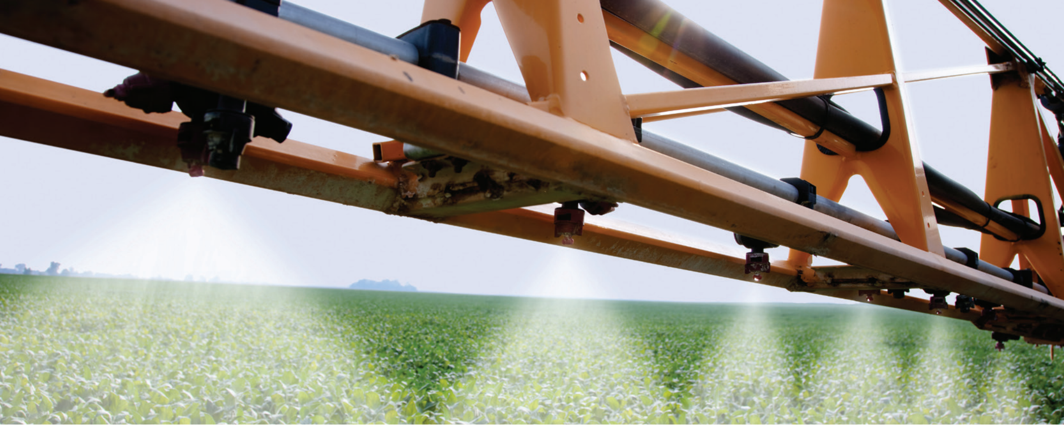
Soybean spray.