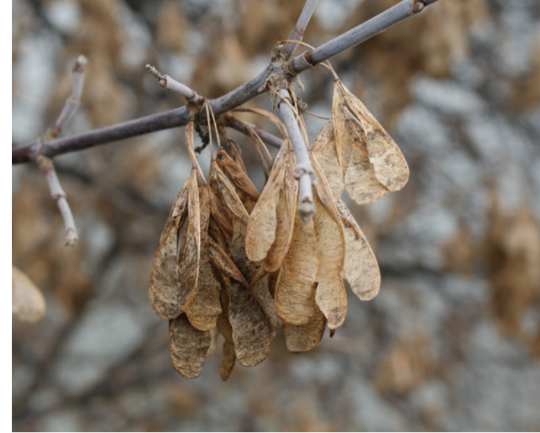
Box elder maples provide important food resources for birds but are sensitive to dicamba.

Dicamba could also impact birds through its effect on bird habitat. The use of herbicides in farming has dramatically altered habitat patterns in North America, and strong evidence exists for adverse effects of changes in habitat pattern on birds. 66 Based on a thorough literature review and analysis, there is a strong argument to be made that the decline of ducks nesting in the prairie pothole region of North America was likely related, at least in part, to adverse alteration of food, nesting, and protective cover in uplands, pothole, and pothole margins from repeated, broad scale use of herbicides. 67 Non-game species dependent on weeds and their seeds are especially vulnerable to more intensive and extensive use of herbicides because of the loss of weedy foraging and nesting sites in fields and adjacent habitats such as hedgerows. 58 In addition to reduced availability of food for chicks, gray partridge declines have also been linked to loss of suitable nesting cover from removal of field margin habitats, particularly hedgerows. 57