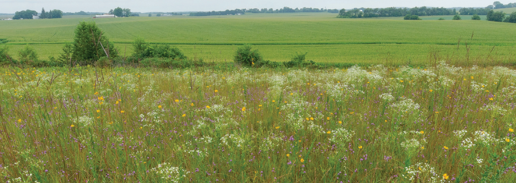
Smith-Reiner Drumlin Prairie in Wisconsin.