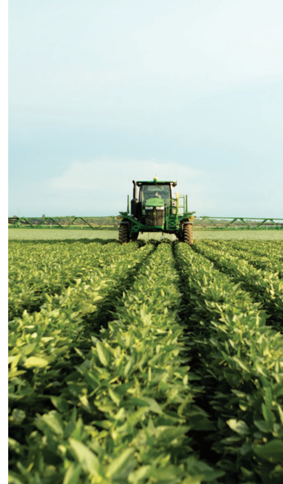
Farmers and applicators often apply multiple pesticides in a single application to reduce costs or improve efficacy. However, tank mixing dicamba herbicides may increase their potential for volatility and drift.

Many pesticides can have a synergistic effect when they interact with one another, either in the air, in water, on a plant surface, or when mixed in a tank at the time of application.