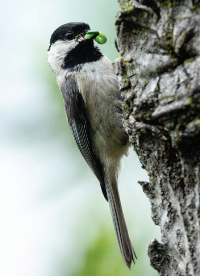
Carolina chickadee brings a caterpillar to its nest.

bird species feed their young on insects, and caterpillars are one of the main sources of protein for young birds. 59-63 Native trees host thousands of species of larval moths and butterflies; oaks, willows, birch, poplar, and cottonwoods each support more than 300 species of moths and butterflies. 64 Research has shown that even subtle changes in insect prey availability in agricultural landscapes caused by pesticides can have harmful