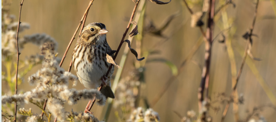
Savannah sparrows will feed on seeds from field margin plants like goldenrods.

be given the adequate financial resources required to improve the reporting process, as well as to investigate incidences and properly enforce their pesticide laws.