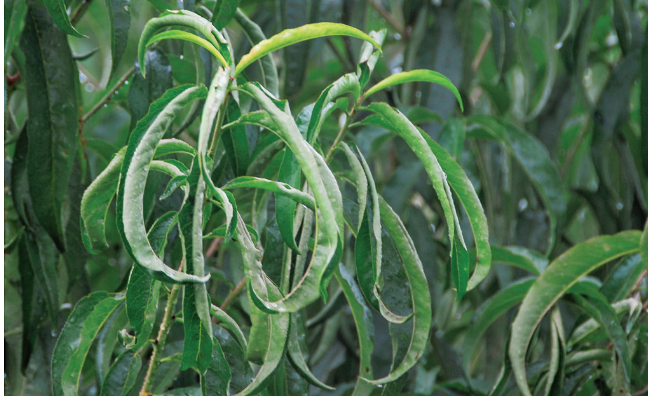
Many fruit and vegetable crops, like this peach tree are very sensitive to plant growth regulator herbicide drift.

The widespread reports of dicamba volatilization and injury to fruits and vegetables over the past few years prompted the U.S. Department of Agriculture's Fruit and Vegetable Industry Advisory Committee, which represents the retail and commercial produce industry, to "strongly recommend the registration for XtendiMax, Engenia, FeXapan and Tavium or any other new formulations for in-crop use in soybeans and cotton not be renewed when the current registration expires" in its set of recommendations released in spring 2020. 25