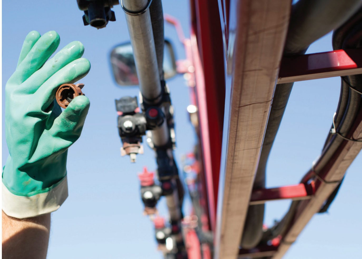
Farm workers, pesticide applicators, and their families are the most likely among the general population to have repeated exposures to agricultural pesticides, including dicamba.

While it is not the main focus of this report, it should be noted that little is known about the environmental impacts of widespread use of dicamba on human health. There is very little published information on the environmental loadings from the recent increased use of this herbicide. Among the general population, farmers, farm workers, pesticide applicators, and their families are the most likely to have repeated exposure to agricultural pesticides, including dicamba. 83-85 Communities living near agricultural lands also experience higher exposure to pesticides than the general population. 86