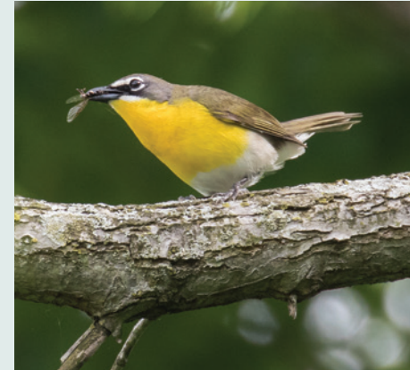
Yellow-breasted chat with insect.

Document symptoms in addition to reporting. While it is important to report symptoms to your local agency that regulates pesticide use, it is just as important for you, the landowner to document suspected injuries. First be sure the injury is not something you caused yourself! Many lawn care products contain herbicides that kill broadleaf plants and these chemicals can move through the soil or volatilize and injure your trees and plants. If herbicide injury has occurred to your property, symptoms will likely be present on more than one plant type or species in the area. It is good practice to examine trees, vines, shrubs, and/or several types of herbaceous plants in the area for symptoms, this can help rule out other causes of injury. When you notice symptoms, document them immediately, noting the date, plant name, location, and any important notes. Also include several photographs. It is best to get a couple close-up photos of symptomatic leaves as well as one or two of the whole plant or tree. Be sure to also take note of the symptoms you observe such as leaf cupping, stunting, elongation, twisting, or branch dieback, etc.