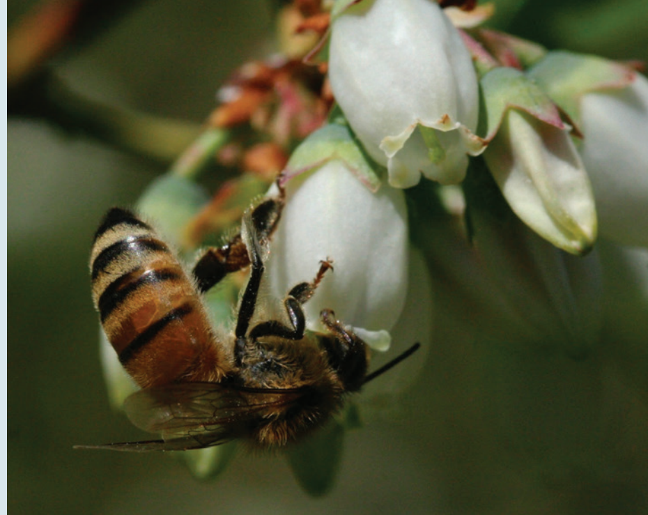
Honey bee nectaring on highbush blueberry. Spring-flowering trees and shrubs are important food resources for many pollinators.