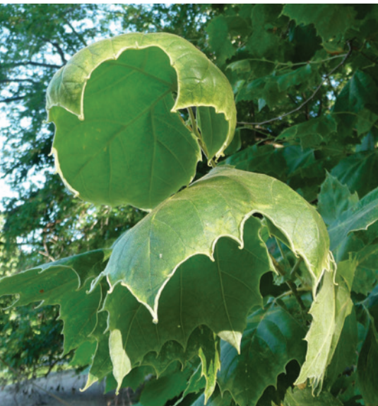
Sycamore leaves showing symptoms of dicamba injury.

perennial herbaceous plants may be able to “grow out of” visible symptoms. However, the same does not appear to be true for woody plants. Studies of woody perennial species have shown symptoms of injury remain visible long after exposure. 14 Visual symptoms can remain for the entire growing season and can be observed in fallen leaves.