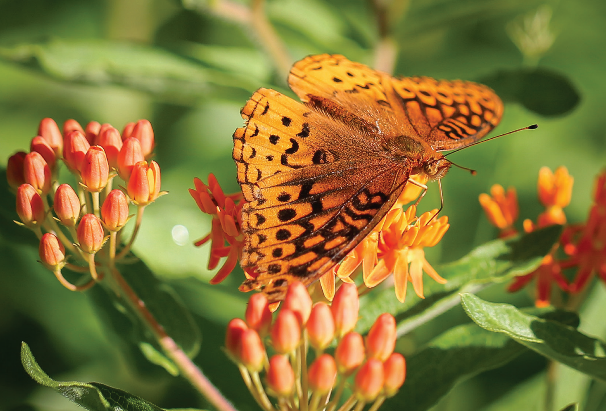
Fritillary butterfly on butterfly milkweed.