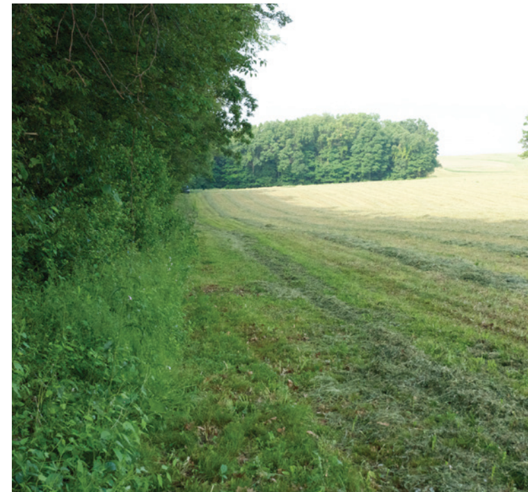
Damage from volatile herbicides does not stop at the field edge. Dicamba drift places wild plant communities and the wildlife that depend on them at risk.

need for further research on impacts to various species from dicamba. While concerns around drift apply to other phenoxy herbicides such as 2,4-D— which has also seen increasing use and associated off-site injury complaints in the past year—this report is focusing on dicamba, given the upcoming registration decisions for over-the-top dicamba products in 2020. This report highlights the threats to non-target crops, wild plants, and other wildlife from the use of dicamba herbicides, and provides a few short-term and long-term recommendations for reducing environmental harm from these volatile herbicides.