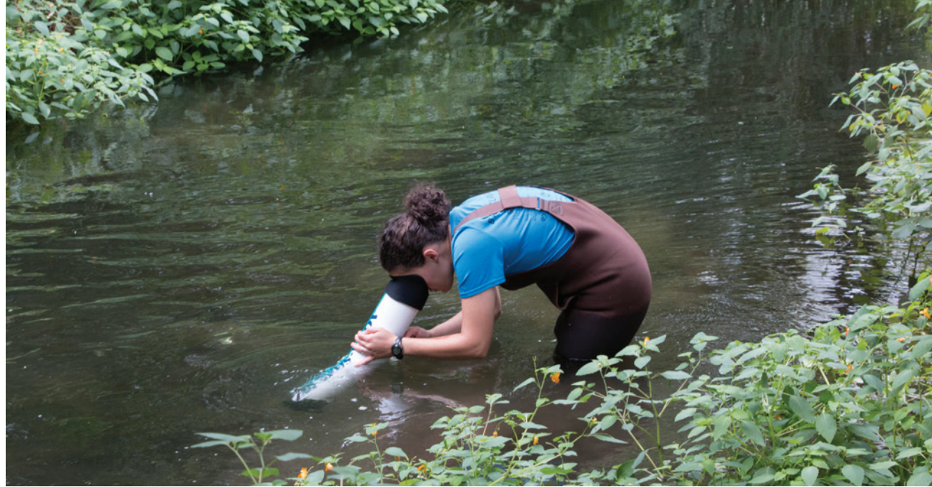
Like many other pesticides, dicamba is water soluble and can easily move into and contaminate aquatic ecosystems, posing risks to aquatic life. Here, the lead Freshwater Mussel Biologist for the Xerces Society surveys a stream for freshwater mussels, which are highly susceptible to environmental contaminants.

Many pesticides, including the herbicides dicamba and 2,4-D, are water soluble and can readily enter surface water bodies, where they may also pose risks to aquatic life.