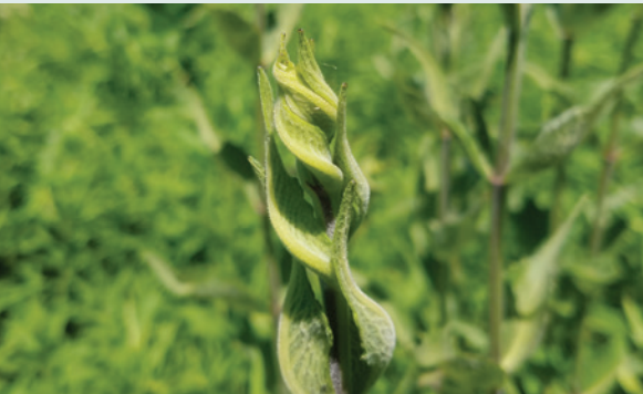
Rosinweed twisting.