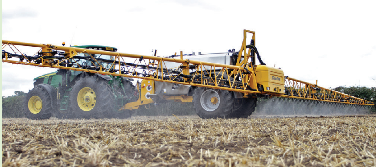
Dicamba is commonly applied early in the season to control emerging weeds.

While early season burndown use of dicamba herbicides has always posed some concerns, the level of drift injury has spiked since the introduction of new in-crop formulations used later in the season, when temperatures are higher.