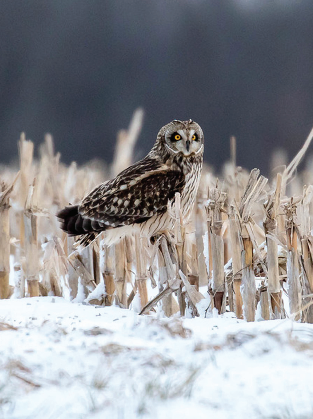
Short-eared owl in corn field.