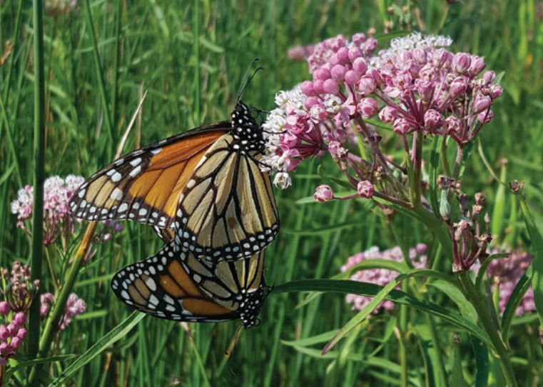
Monarch butterflies on swamp milkweed.

require more energy and increase the risk of mortality from predators, weather events, and pesticide exposure.