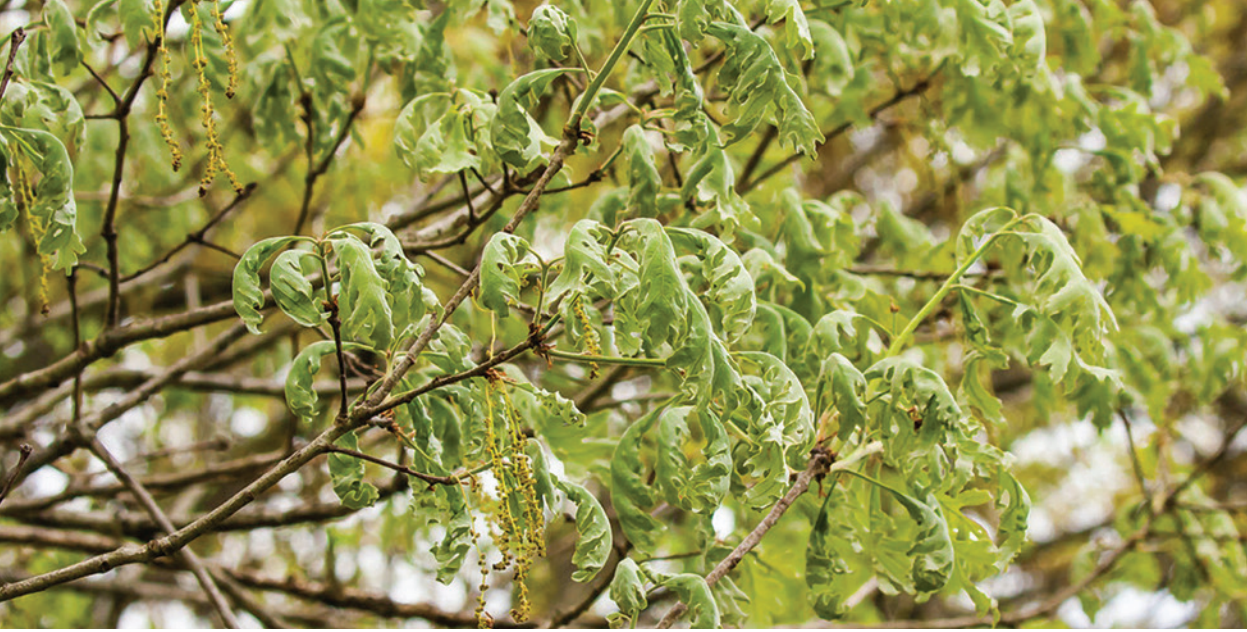
White oak with symptoms of growth regulator herbicide injury. Credit: Martin Kemper.