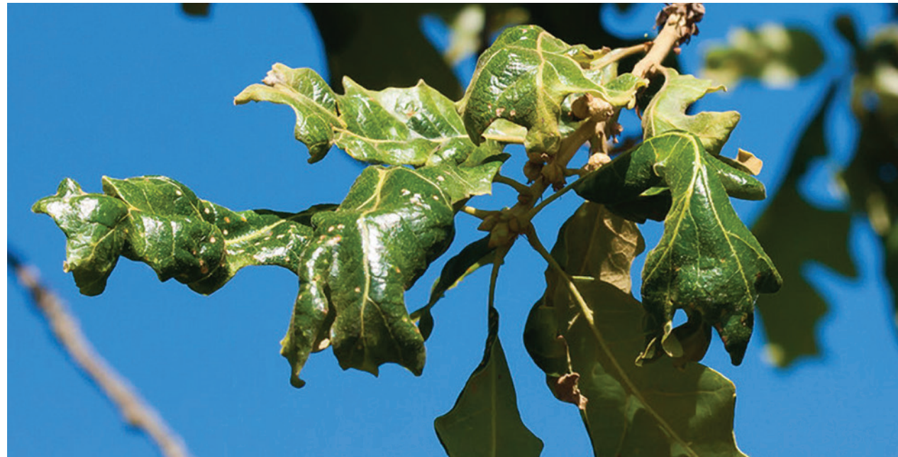
Post oak with deformed and stunted leaves.

site, they pose threats to wild plants and the wildlife that depend upon them. Loss of native plants and declines in forage quality poses risks to bees and other beneficial insects that rely on pollen and nectar for food. These risks ripple through numerous food webs, including those of birds, which rely on a wide variety of plants and invertebrates for food resources. This report will discuss what’s known about the wider ecological impacts of dicamba and related herbicides to native plant communities and the wildlife they support, and provide a few short-term and long-term recommendations for reducing environmental harm from these volatile herbicides.