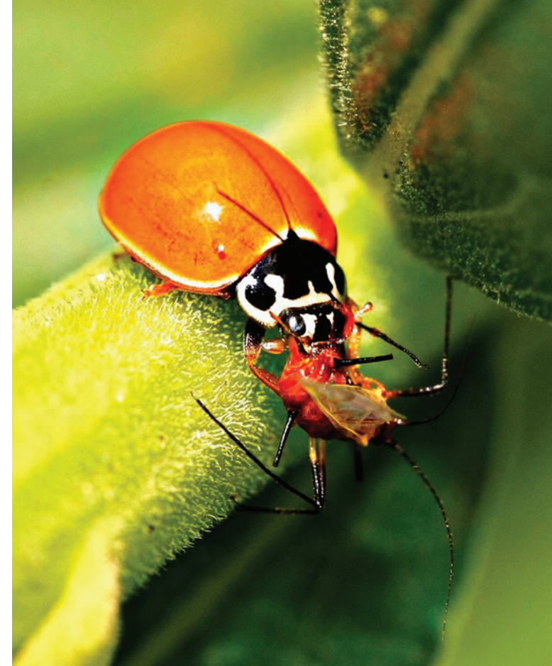
Lady beetles, which are important beneficial insects for controlling soft-bodied insects like aphids, are threatened directly and indirectly by dicamba herbicides. Here, a polished lady beetle feeds on an aphid.

However, the largest risk of dicamba use to bees and other beneficial insects that rely on pollen and nectar for food is likely to be loss of food sources and declines in forage quality. The quantity, quality, and diversity of floral resources can affect bee development, physiology, and immune response, with many potential impacts on individual bee and colony longevity and reproductive capacity. 46-48 The increased use of these herbicides during the middle of the growing season for in-crop weed management threatens a wide array of flowering broadleaf plants that provide food and shelter for bees and other beneficial insects. Glyphosate use on glyphosate resistant crops led to an estimated 58% decline in milkweeds in the Midwest, and an associated decline in breeding monarchs between 1999-2010. 49 Dicamba has a greater potential to reduce flowering plant survival in areas farther from agricultural fields than glyphosate due to its greater volatility.