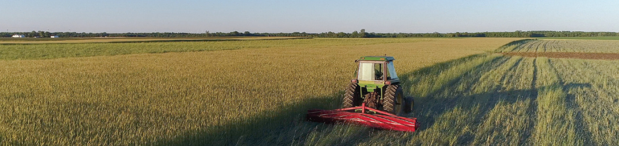
Roller crimping rye.

If using chemical methods of weed control, farmers should practice careful herbicide resistance management by rotating different herbicide modes of action and not continually applying herbicides in the same grouping. 120 Spot spraying and hand weeding in fields and field margins can also be important in a zero tolerance approach. Farmers can also burn collected piles of weeds that have already produced seedheads. However, even with careful resistance management, cross-resistance to multiple herbicides can sometimes develop.