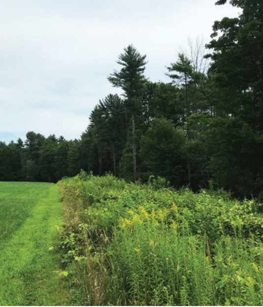
Field edges can be important wildlife habitat.

Ecological weed management practices include choosing crop varieties that are competitive with weeds, adjusting planting dates and depths of crops to help get ahead of weed growth, and managing nutrients in ways that give crops the competitive edge.