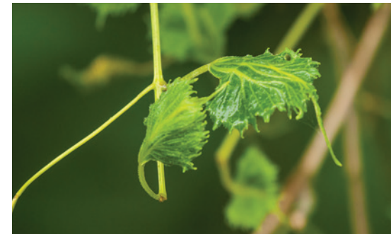
Wild grape stunted, with irregular margins.