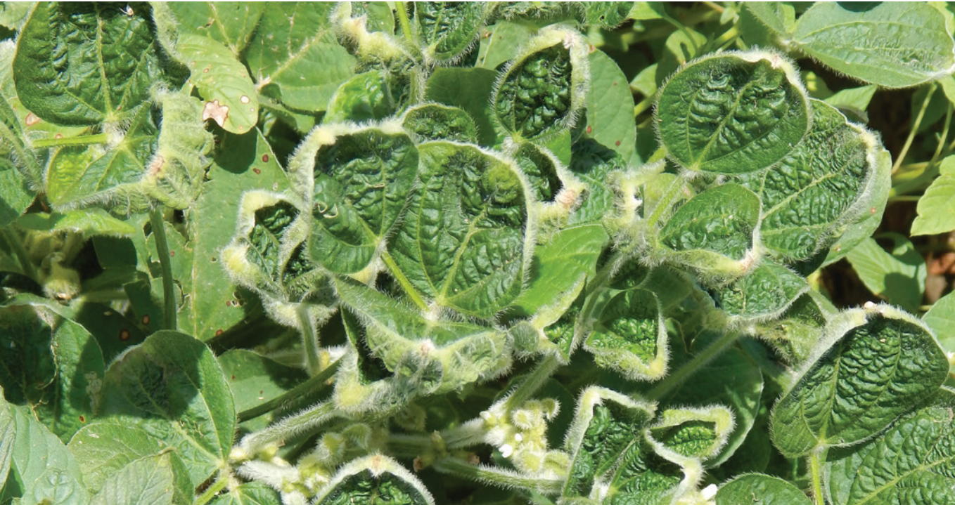
Soybean is highly susceptible to injury from phenoxy herbicides like dicamba and 2,4-D. Very small drift concentrations of these herbicides can cause visible symptoms, like this leaf cupping.

The updated labels included downwind buffer requirements for over-the-top dicamba and 2,4-D products, which differ by product and rate. 99 Applicators must leave a 110-foot or more unsprayed buffer from the downwind field edge for dicamba products (e.g., XtendiMax, FeXapan, Engenia) and a 30-foot buffer for 2,4-D products