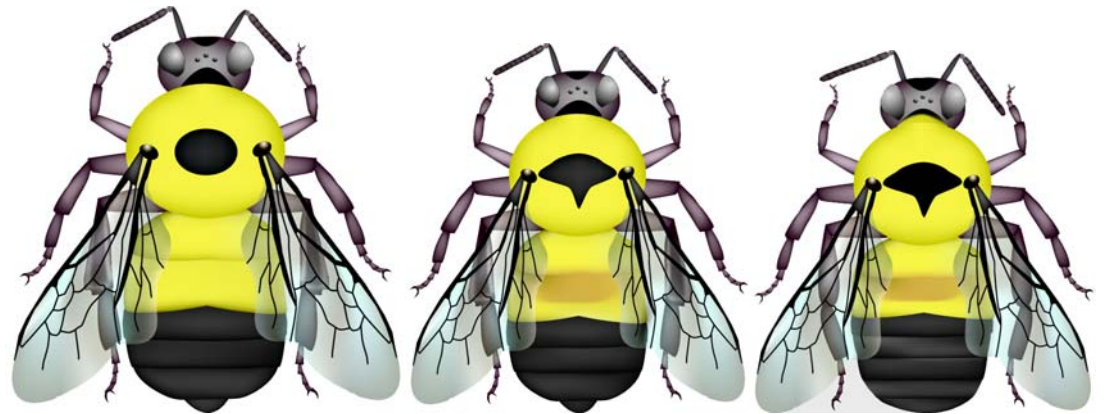
Figure 2. Illustrations of a rusty patched bumble bee queen (left), worker (center), and male (right) by Elaine Evans, The Xerces Society.

Rusty patched bumble bee males are 13 to 17.5 mm in length with a breadth of 5 to 7 mm (Mitchell 1962). Their hair is largely black on the head, but with a few pale hairs intermixed near the top of the head. Black hairs sometimes form an obscure band across the middle of the thorax, otherwise the hair on the thorax is largely pale yellowish. The first two tergal segments have pale yellow hair. Like workers, males usually have a reddish patch centrally and anteriorly located on the second tergal segment of the abdomen. The hair on the rest of the abdomen is black. See Figure 2 for an illustration of a rusty patched bumble bee male.