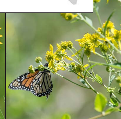
Left to right: Monarch on swamp milkweed, beach blanket-flower, and monarch on wingstem.

The Southeast region encompasses the states of Kentucky, Tennessee, Louisiana, Mississippi, Alabama, Georgia, and South Carolina. Reaching from the Gulf of Mexico to the Atlantic Ocean and spanning the Smokey, Blue Ridge, and Appalachian mountains, this area boasts incredible ecological diversity within a complex network of coastal marshes, longleaf pine forests, bottomland hardwoods, and mixed riparian woodlands. A diverse assemblage of wild pollinators thrives in these habitats, including summer breeding and fall migrating monarchs.