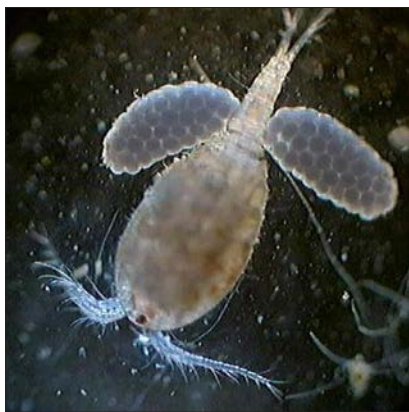
Copepods, like this Macrocyclus albidus , were successfully used in New Orleans as a natural way to control mosquitoes breeding in waste tires.

You can read more about ongoing efforts in New Jersey to control mosquitoes using copepods at: http://www.nj.gov/dep/newsrel/2012/12_0072.htm .