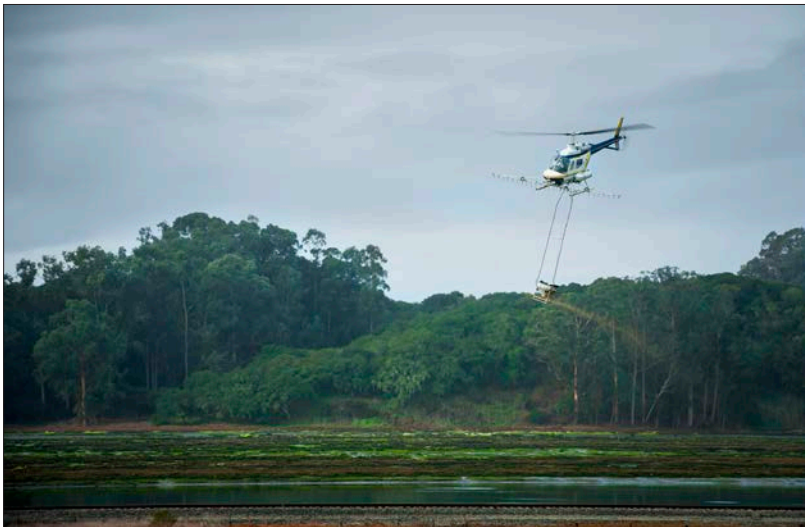
Decades of widespread application of pesticides, insect growth regulators, surface oils, and bacterial toxins have had extensive impacts on wetlands and the animal communities that rely on them.

The CDC’s guidelines for IPM can be found at http://www.cdc.gov/nceh/ehs/eLearn/IPM.htm . The CDC’s 2013 guidelines for management of West Nile virus also contain important information regarding the value of IPM. These can be downloaded at http://www.cdc.gov/westnile/resources/pdfs/wnvGuidelines.pdf .