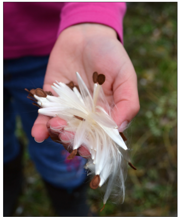
You can collect your own milkweed seeds to use in plantings.