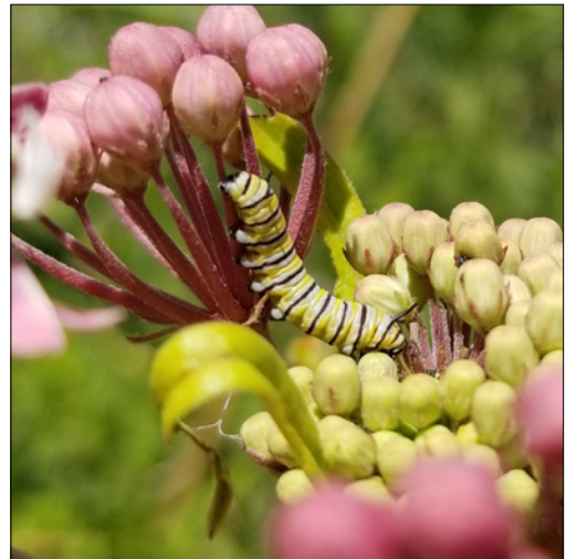
It is important to avoid pesticide use while any monarch life stage is present.