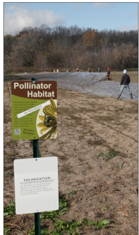
Solarization in process at the Heidel Family Farm in Wisconsin.