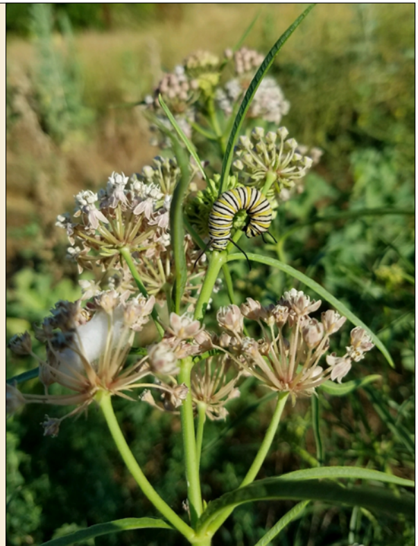
Above: Monarch caterpillar on narrow-leaved milkweed at the Uptons' farm. Below: California poppies and monarch nectar plants abound in a 15-acre wildlife area adjacent to the Uptons' farm.

Monarchs can often be spotted nectaring there in spring, and their caterpillars have been found on the milkweed.