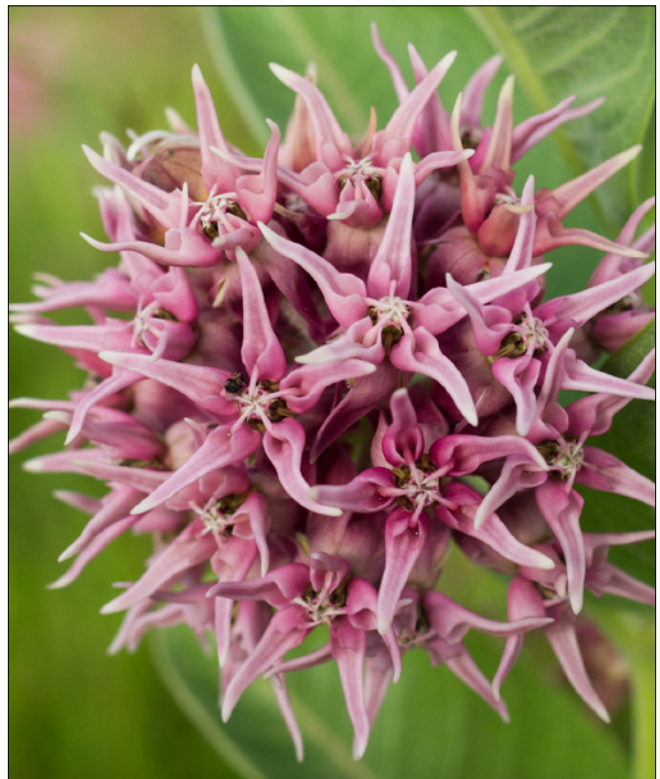
Showy milkweed ( Asclepias speciosa ), a common Sacramento Valley species.