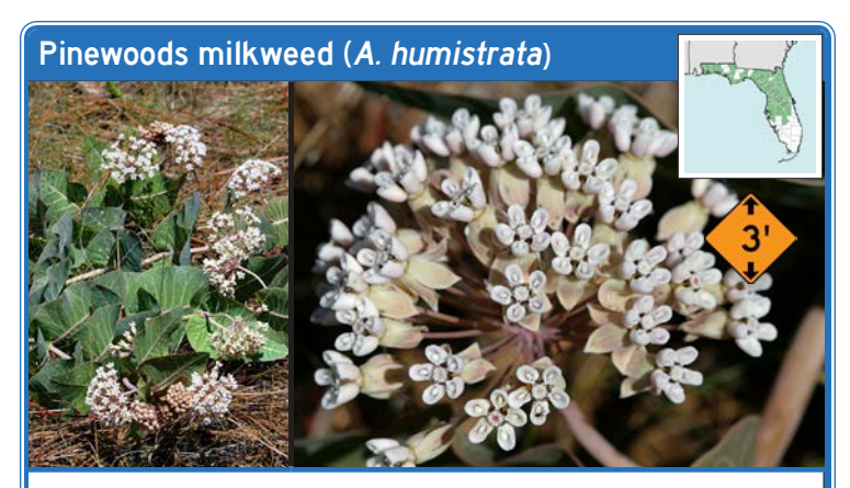
PLANT: One to multiple sprawling stems; usually smooth. LEAVES: Opposite; oval-shaped; bases that clasp stem; purple veins; usually smooth. HABITAT: Pastures, open woods, sandhills, scrubland. SOILS: Sandy; dry. BLOOM: Mar–Jun; pink to white flowers.