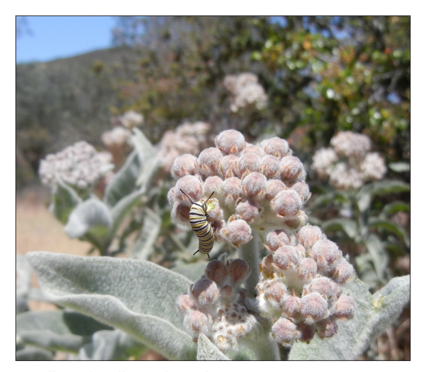
Woollypod milkweed (Asclepias eriocarpa), growing in southern California, provides food for a hungry monarch caterpillar.

Check out Xerces' Milkweed Seed Finder (xerces. org/milkweed/milkweed-seed-finder) to locate native milkweed plant materials (seeds, plugs, plants) in your area, and Xerces' Western Monarch Milkweed Mapper (monarchmilkweedmapper.org) to see which species of milkweed grows in your area.