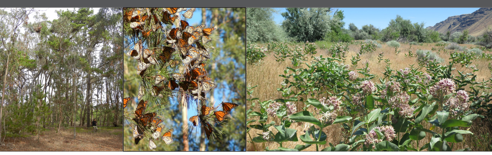
From the overwintering groves of coastal California to milkweed in the open sagebrush of eastern Washington, protection and management of habitats is urgently needed chance to save the western monarch migratory phenomenon.