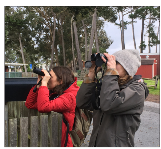
Valuable information can be gathered with little more than a pair of binoculars and a few hours of time.

If you live near an overwintering site and can make at least a 2-year commitment, consider joining the dedicated group of volunteers that