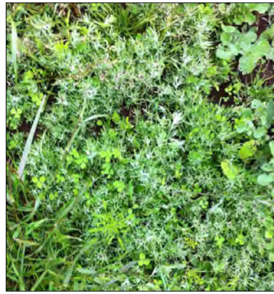
Figure 6. In the first spring after seeding the previous fall, this planting site is dominated by annual and biennial weeds like wild radish (left). Mowing the site periodically during the first year (ideally at 8” or higher) will prevent these short-lived weeds from producing more seed, and allow sunlight to reach the slower-growing natives (right), which are generally unharmed by the occasional mowing.