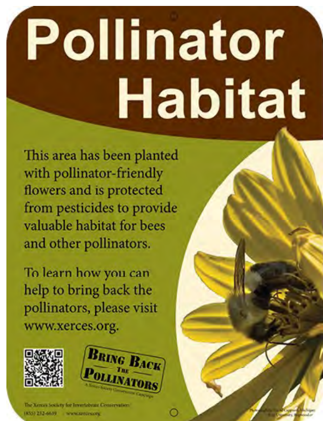
Figure 8. Newly planted areas should be clearly marked to protect them from herbicides or other disturbances. Using signs such as the one above can be a useful tool to designate protected pollinator habitat.

Finally, note that some common farm-management practices can cause harm to bees and other beneficial insects. Insecticides are especially problematic, including some insecticides approved for organic farms. Therefore, if insecticide spraying is to occur on the farm, it is critical that the Conservation Cover planting area is outside of the sprayed area and/or protected from application and drift.