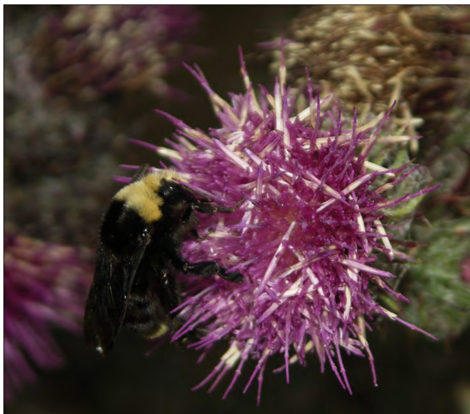
(Photo: Bumble bee on native thistle (Cirsium edule))