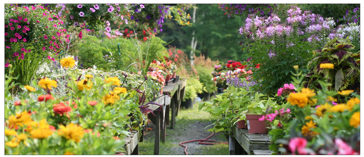
Retail and production nurseries can take pride in being partners in pollinator conservation by supplying perennials, shrubs, trees, and annuals that are free from harmful pesticide residues.

Revisit your pest management efforts to see if you can make changes to become more pollinatorfriendly. Prevention, monitoring, and limiting pesticide harm all work together as strategies to achieve pollinator stewardship goals.