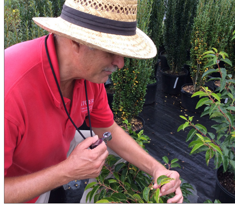
Consistent scouting and correct insect and disease identification is critical for tracking pest pressure and making management decisions. Pinelands Nursery in New Jersey shares the scouting services of a skilled university extension entomologist with several nearby nurseries, allowing access to high quality information at low cost.

Some nurseries that transitioned away from neonicotinoids simply shifted to other insecticides. Unfortunately, some of these insecticides are nearly as harmful as neonicotinoids (see Table 1).