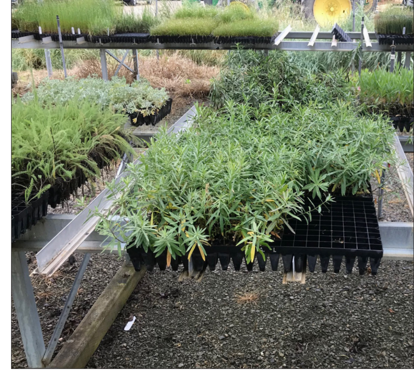
Self-draining metal slatted tables ensure that water drains fully from plant stock. This practice, together with disinfectant foot baths for visitors, has helped Hedgerow Farms nursery in California avoid the destructive Phytophthora pathogen.